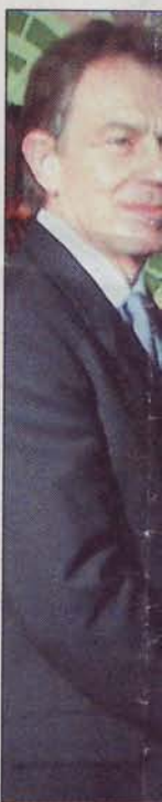
British Prime Minister Tony Blair.

tems would also... Libyan deal... trade mission... the major spoils... United States... knows the only