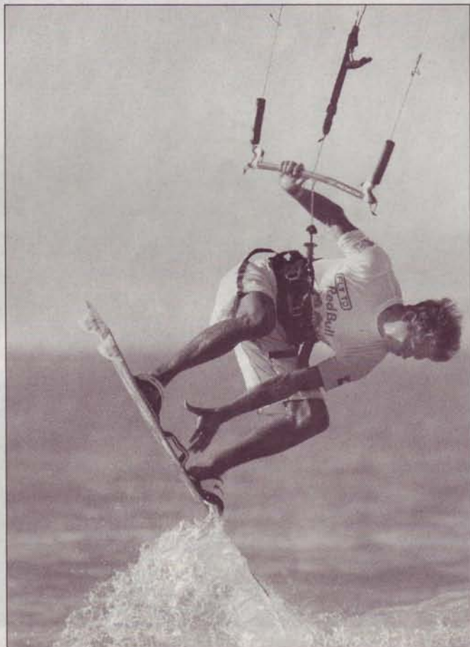
Action from the men's freestyle heats in the Red Bull King of the Air.