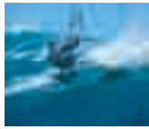
HIDDEN KITE PARADISE