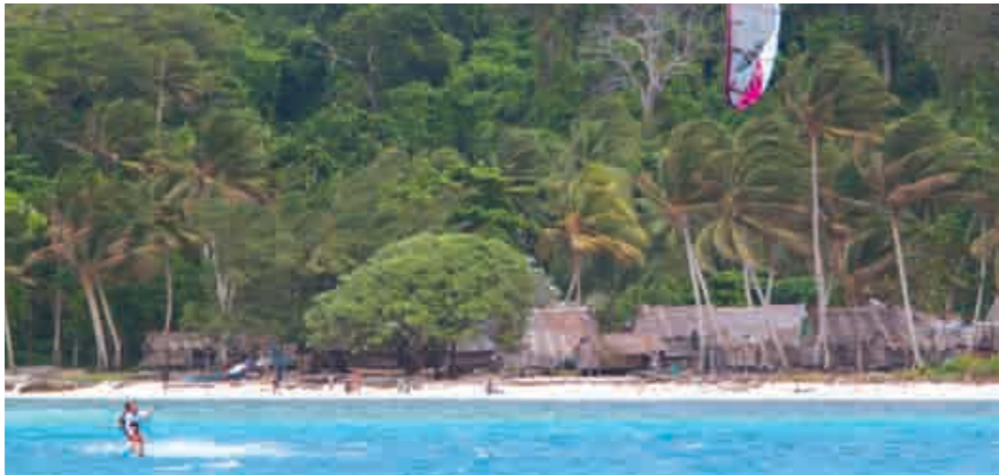
Above: Gabi and Thierry, super stoked, "Blue Lagoon", Trobriand Islands.