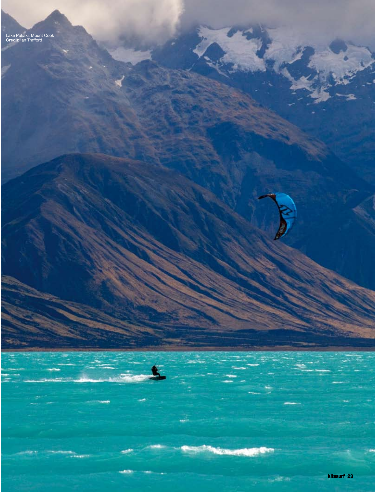
Lake Pukaki, Mount Cook