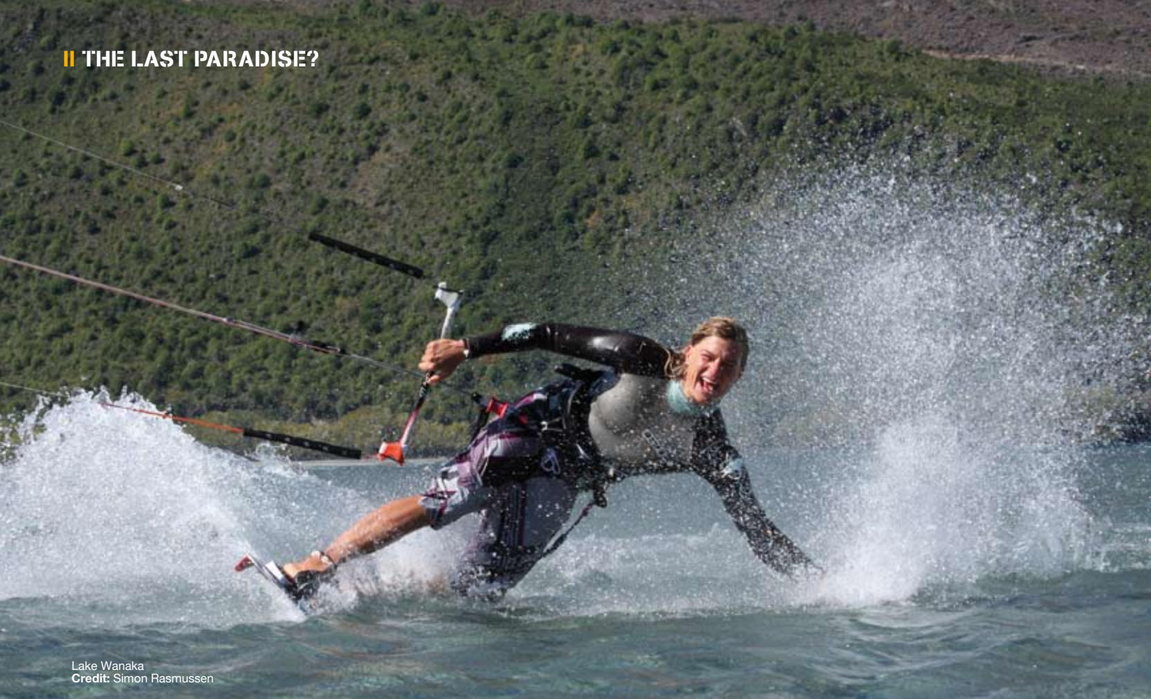
Lake Wanaka

NZ's stunning coastline, world-famous breaks and 'outdoor-adrenalin-spirit' of the locals boosted it right to the top of my 'wish-trip-list' this year. In late March my adventure started. I was going to be there sooner, but I got held up in Western Australia by a roll of decent swells that kept hitting. Never mind, summer can be quite flat in NZ anyway and according to the Kiwis, autumn should bring 'more of everything', meaning more wind and swell, and also rain. I had been working for several weeks on proposals to campervan companies and succeeded in arranging the sweetest van for myself and all my toys through www.paradise.co.nz ; I got a sick mobile home boasting a small hot shower and a super comfy bed – and all that within my rather restricted 'pro-budget', cool! Apart from the vehicle, I didn't prepare much for the trip, I usually try to go with the flow and am not too keen on planning routes, itineraries or stuff like that... and looking back, that was just the right decision. Even if I'd tried to organize a year in advance, I doubt I could have set up a truly once-in-a-lifetime-adventure like the one that I've just had.